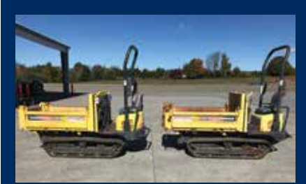
'11 YANMAR C12R-B CRAWLER CARRIER (QTY. 2) 294 & 629 HRS

FL# 5567 1715 Garden Village Drive White Pine, TN 37890