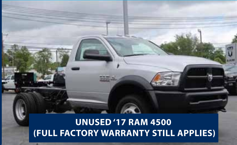
UNUSED '17 RAM 4500 (FULL FACTORY WARRANTY STILL APPLIES)

PRO TEAM AUCTION PERMANENT FACILITY, WHITE PINE TN