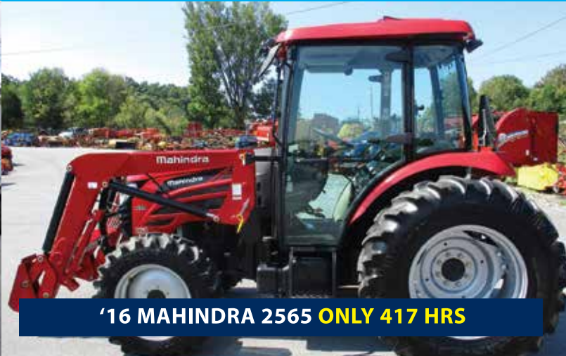
'16 MAHINDRA 2565 ONLY 417 HRS