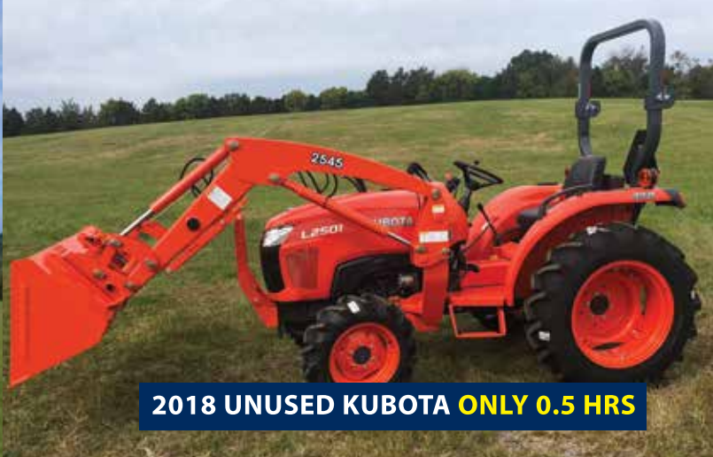
2018 UNUSED KUBOTA ONLY 0.5 HRS

Selling for: Contractors, Rental & Leasing Companies, Lending Institutes, Farmers, Dealers & Others FARM & CONSTRUCTION EQUIPMENT • TRUCKS • TRAILERS FARM TRACTORS & MACHINERY • ARTICULATING LOADERS • EXCAVATORS • SKID STEER LOADERS • BOOM LIFTS • FORK LIFTS • TRUCKS & TRAILERS