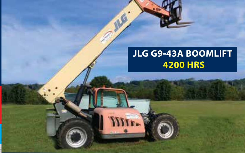
JLG G9-43A BOOMLIFT 4200 HRS