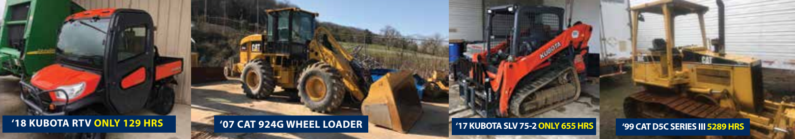
'18 KUBOTA RTV ONLY 129 HRS

PRO TEAM AUCTION PERMANENT FACILITY, WHITE PINE TN