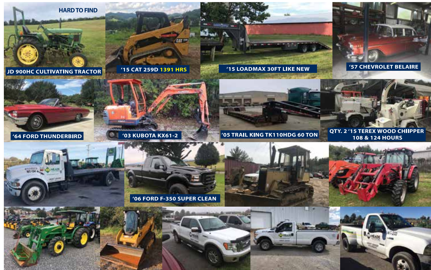
HARD TO FIND JD 900HC CULTIVATING TRACTOR